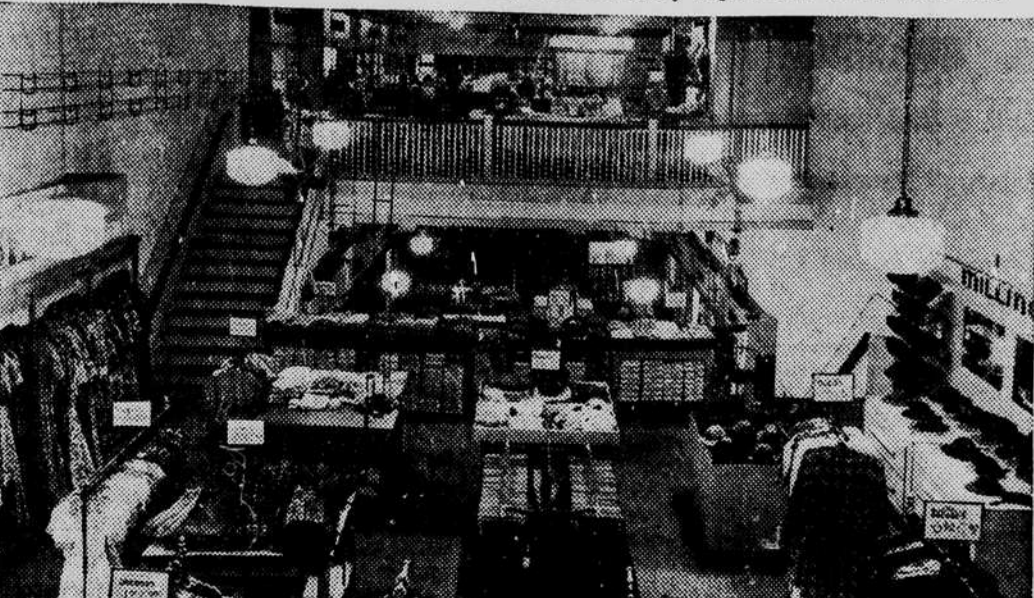
Interior view looking from our cashier's office. Ladies' ready-to-wear and millinery departments in the foreground; housefurnishings, infants', piece goods and cotton shop on second floor; and first floor departments below.