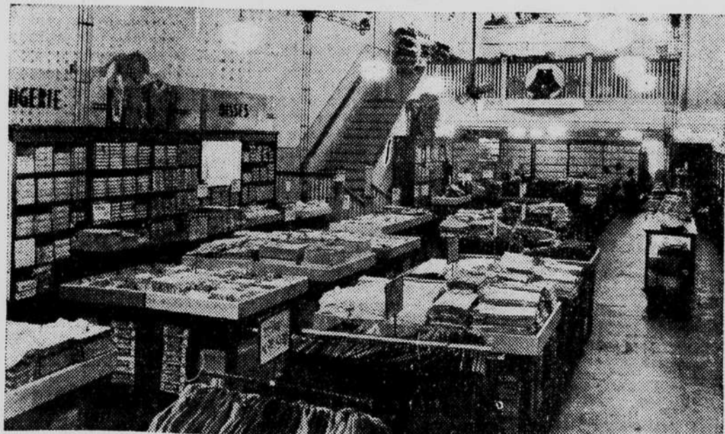
Interior view of our store as it appears on entering. Men's department to the immediate right, work clothes in the rear; shoe department in the background, boys' department below stairs to left, ladies' hosiery and accessory department to the near left.

Penney's... located in the heart of the shopping district of Wilmington! As always a store full of values for all the family and for the home, Penney's pledge is to give to the people of Wilmington a n d Southeastern North Carolina quality merchandise at greatest possible savings. We take this opportunity to thank our loyal customers f o r their patronage and understanding of stock shortages in the period of war now coming to a close. Soon again Penney's shelves and tables will be full with the high quality merchandise you have grown to expect and find in our modern store.