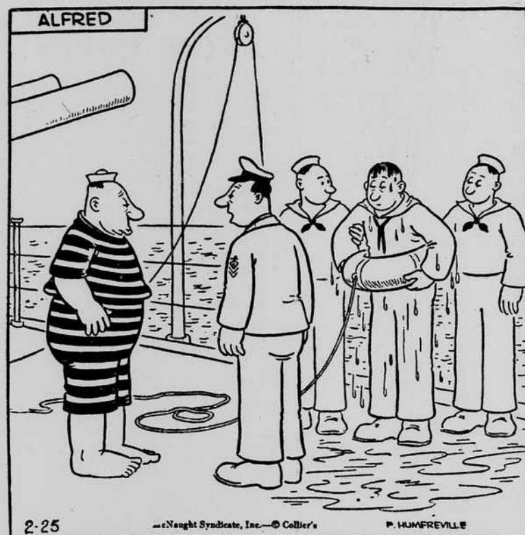
"I'm sorry you're disappointed, Alfred, but we just couldn't wait for you to put on your bathing suit and rescue the man overboard."