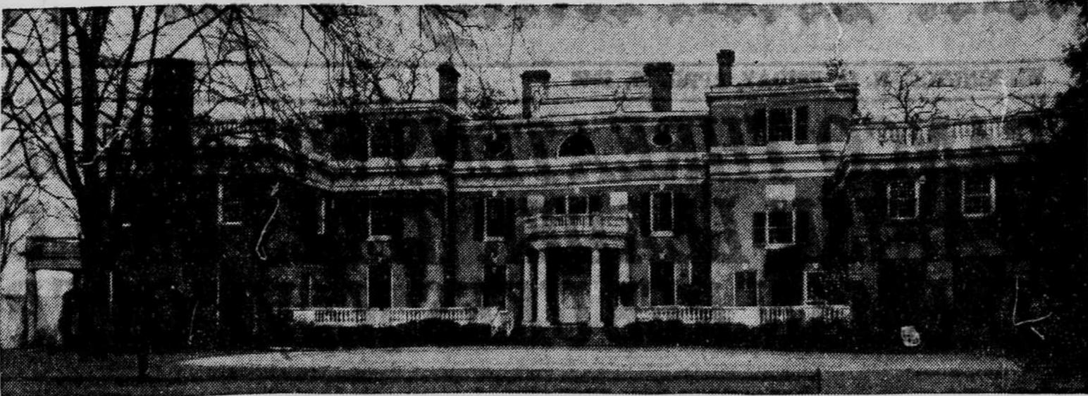
Franklin Roosevelt's ancestral home at Hyde Park, N. Y. It is now administered by the Interior department.