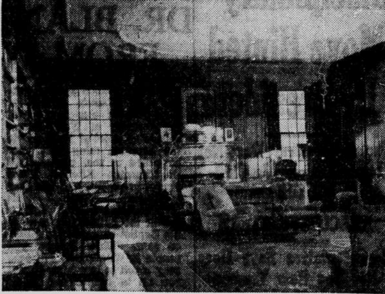
Main floor library of the former summer 'White House.'

CEREMONIES formally dedicating to the nation the home of the late President Franklin D. Roosevelt as a national historic site are being held today at Hyde Park, N. Y., to commemorate the first anniversary of the president's death. The estate is under the jurisdiction of the Interior Department and open to the public for inspection.