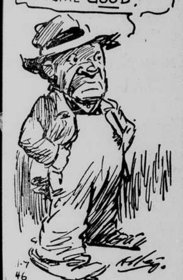
(Released by The Bell Syndicate, Inc.) Trade Mark Reg. U. S. Pat. Office