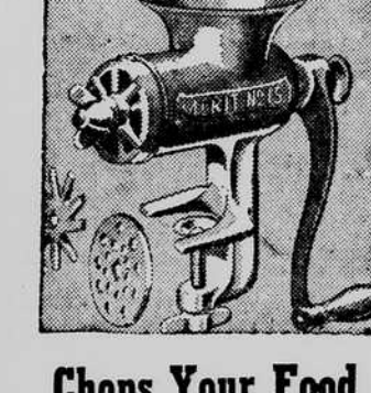
Chops Your Food