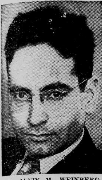
DR. ALVIN M. WEINBERG