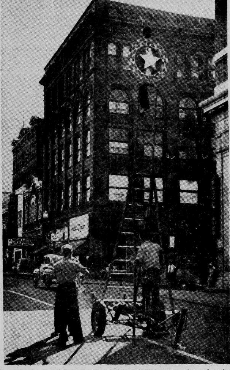
Employees of the Brooks Electrical Company are shown hanging the Christmas lights in downtown Wilmington. The thousands of multi-colored bulbs will be turned on Nov. 21 and will remain lighted each night until Jan. 2.