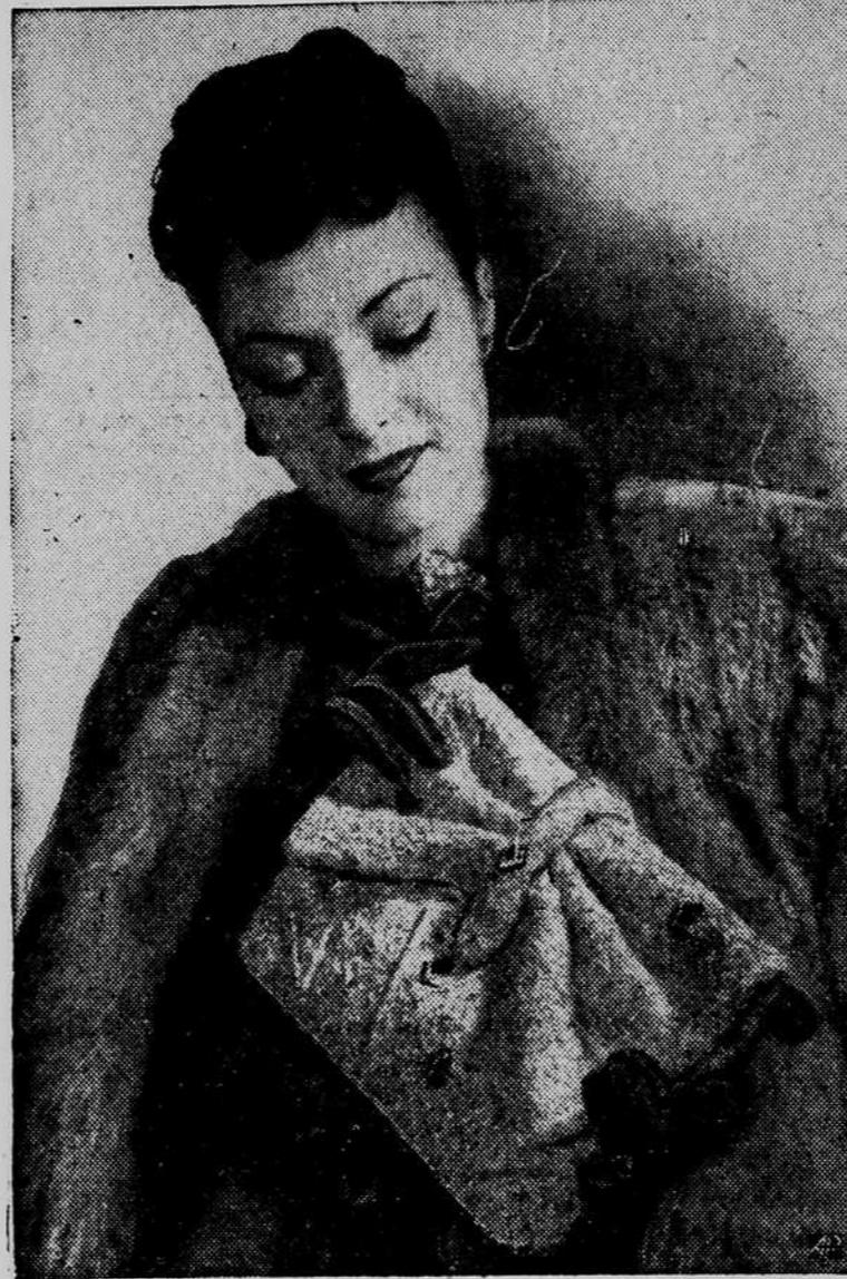
BELLE OF THE BALL... She carries an evening bag big enough to hold all her gear, a delight to any escort. This is in fabulous gold embroidery, bejeweled.

When your child catches cold, rub his little throat, chest and back at bedtime with warming, soothing Vicks VapoRub. Its special relief-bringing action goes to work instantly... and keeps working for hours to relieve distress while he sleeps. Often by morning, most distress of the cold is gone. Try it! Discover why most young mothers use the one and only Vicks VapoRub.