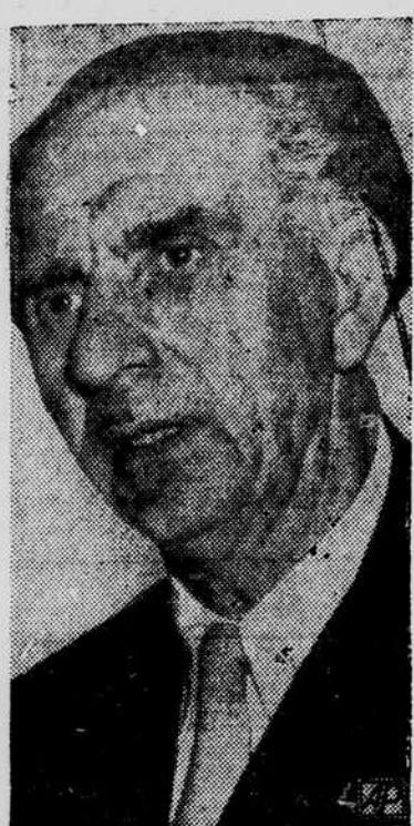
Greek Minister of the Interior George Papanicolaou (above), voicing his government's view on President Truman's speech before a joint session of Congress, told newsmen in Athens that, "we wish to express the profound gratitude of the nation."