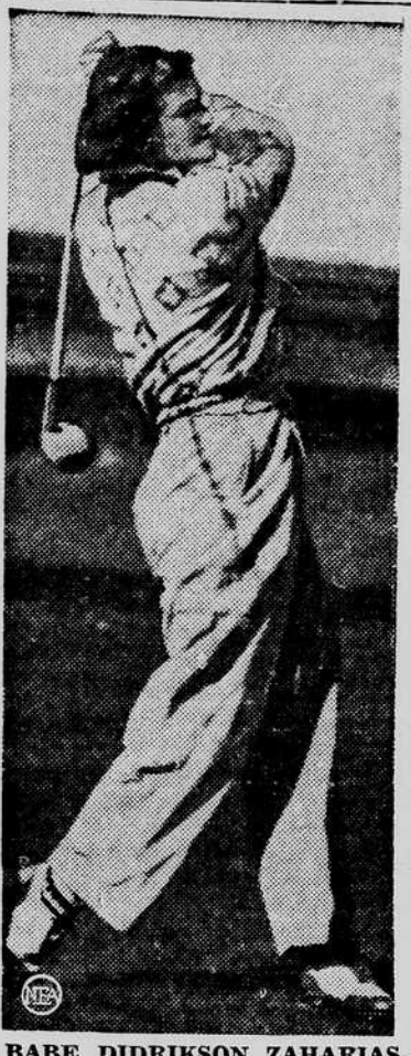
BABE DIDRIKSON ZAHARIAS, corduroy slacks and all, tees off at Gullane, Scotland, during match play for the British Women's Amateur golf title...