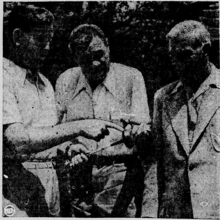
BEFORE RETURNING TO the hospital for another checkup, Babe Ruth had a few rounds of golf in Detroit with these former big leaguers: Yankee Sam Byrd, left, and Indian Tris Speaker.