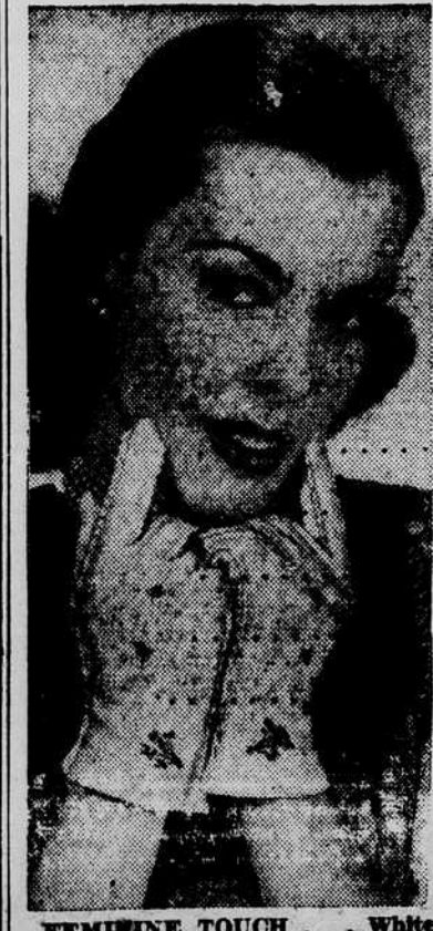
FEMINE TOUCH... White shorties hand-embroidered, to beam with new...

BY CHARLOTTE ADAMS A Good Sunday Meal Cucumber Hors d'Oeuvres Whole Boiled Lobster Fried Potato Dice with Red and Green Peppers Scalloped Patty Pan Squash Lettuce, Cress and Turnip Salad Fresh Pineapple Ice Cream (Recipe: Serve Four) Fried Potato Dice with Red and Green Peppers 2 cups of raw potato, diced, 1 tablespoon salt, 1 sliced onion, 1 tablespoon fat, 2 tablespoons green pepper, chopped fine, 1-2 tablespoons pimiento, chopped. Wash and pare potatoes and cut in dice. Cover with boiling water, add salt and boil for five minutes. Drain on a towel. Fry in deep fat. Drain on soft paper. Cook onion in one tablespoon fat for five minutes. Remove onion and add green peppers and pimiento. When