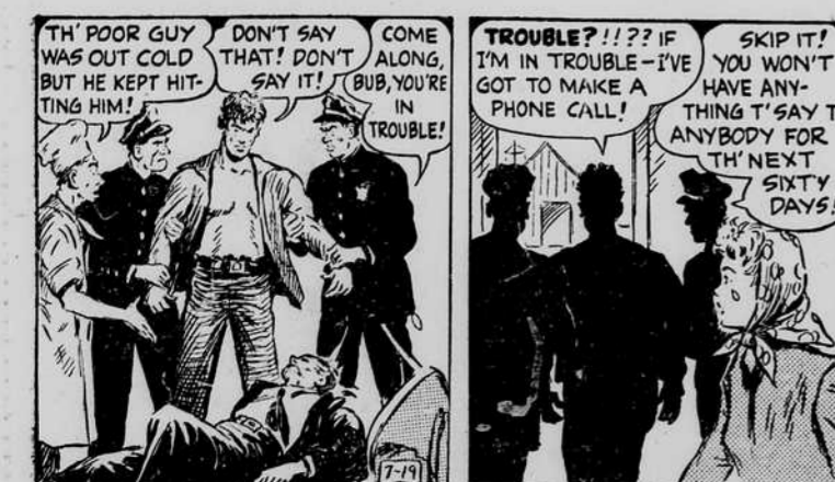
ABBBIE an' SLATS