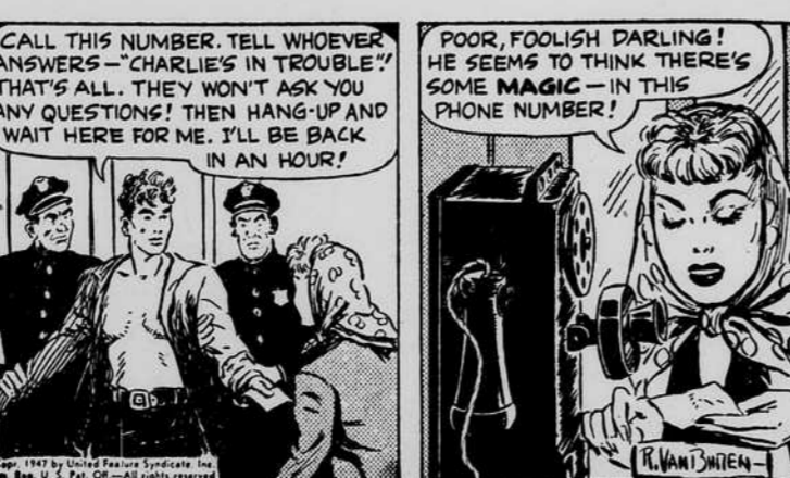
ABBBIE an' SLATS