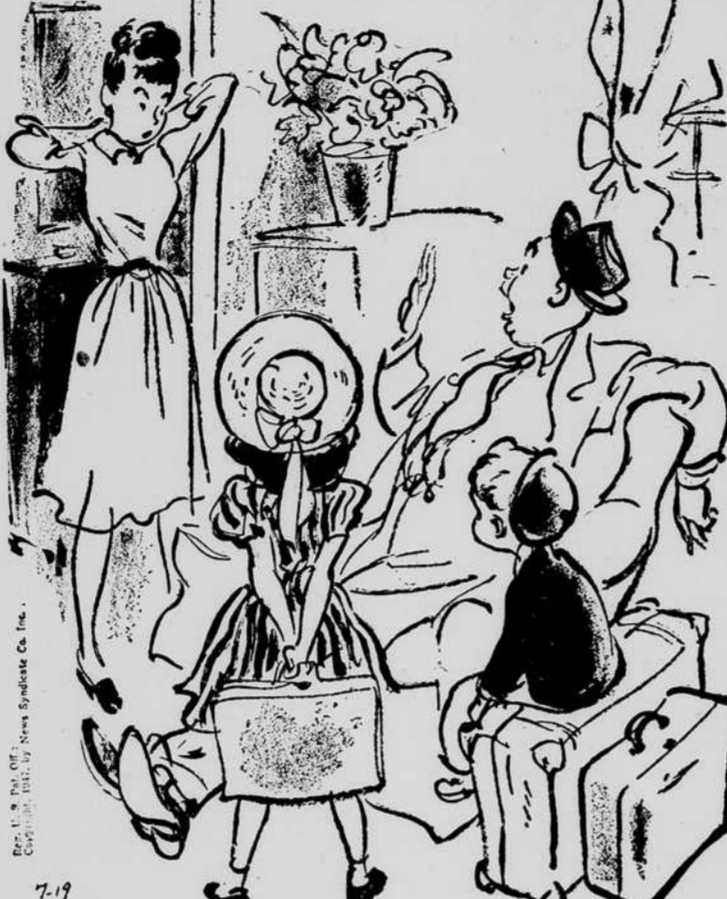
"Oh, there's plenty of time! At least ten minutes before we have to start rushing like crazy."