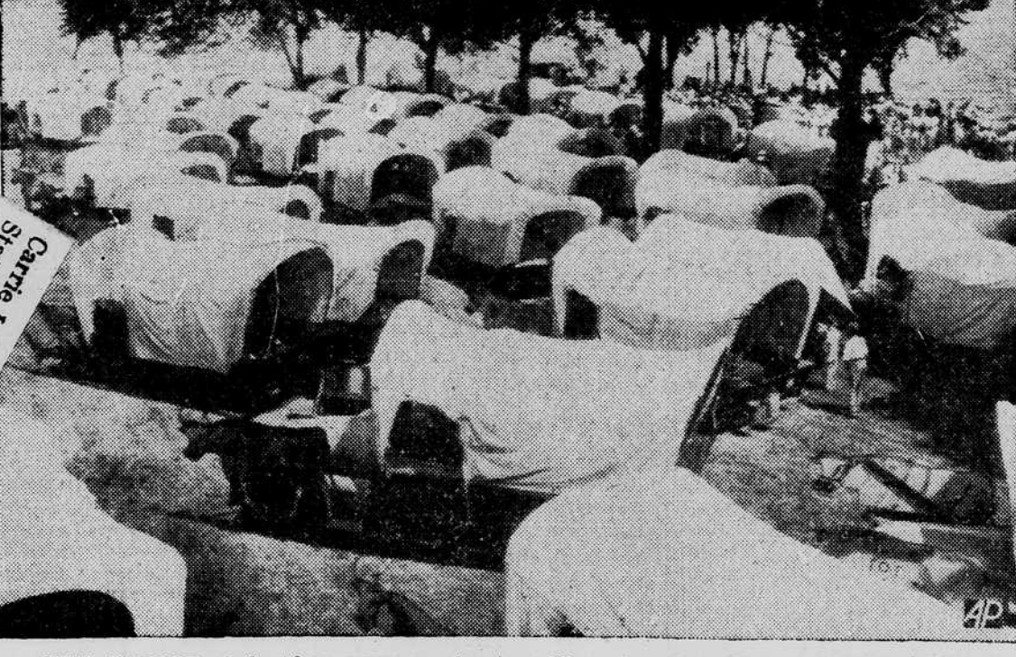
THIS IS PART OF THE 72-car caravan of automobiles, rigged up with superstructures of prairie schooners and plywood oxen, in which 148 members of the Church of the Latter Day Saints are traveling along the general route their Mormon ancestors took from Nauvoo, Ill., to Salt Lake City 100 years ago to found the state of Utah.

'Covered Wagons' On Old Mormon Trail gain