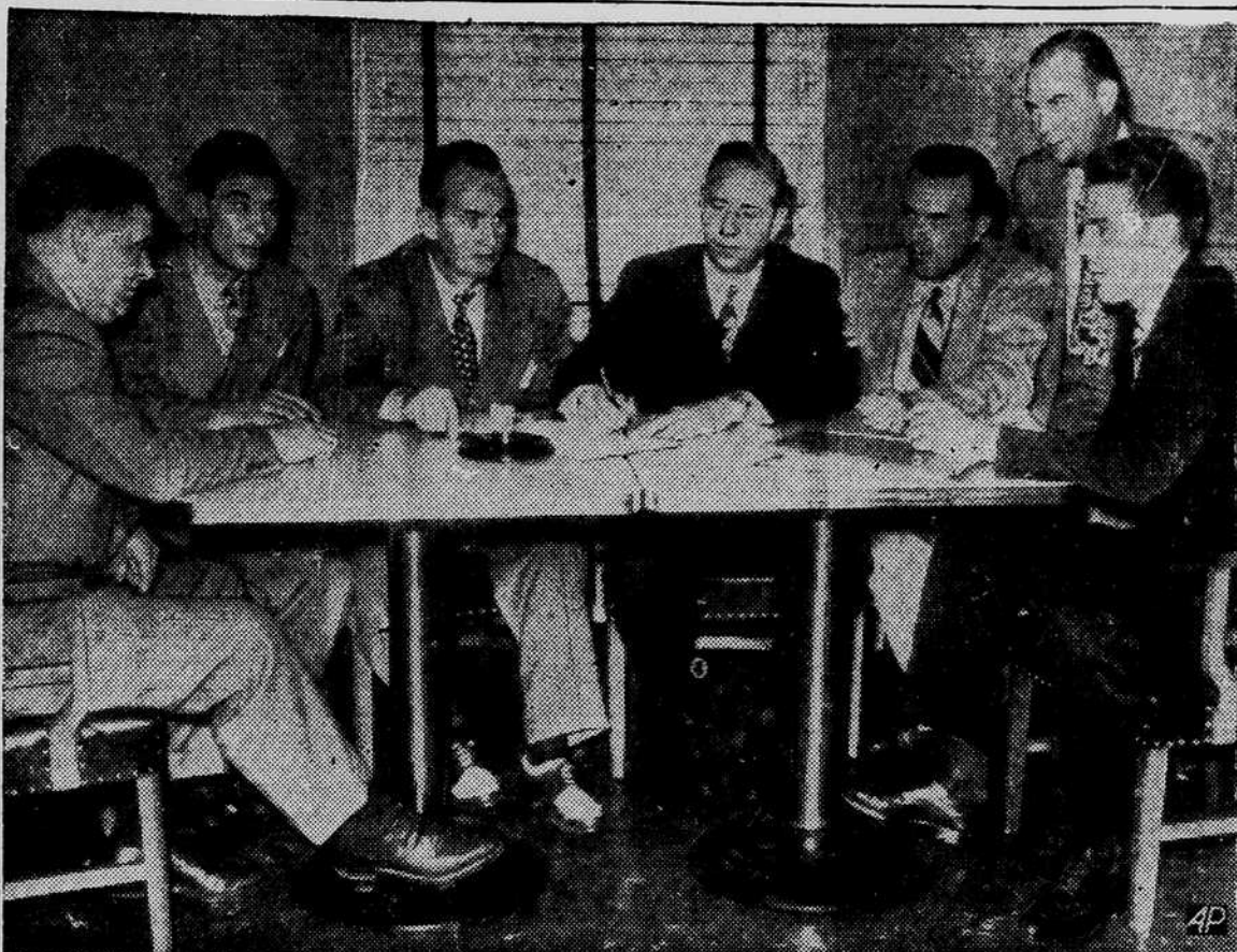
NEGOTIATORS FOR THE UNITED AUTO WORKERS (CIO) and the Ford Motor company meet in an attempt to settle their dispute over the issues of a workers' pension and Taft-Hartley labor law provisions.