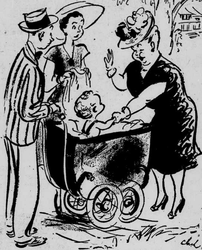
"Why, h is NOT homely! But you're lucky he's a boy so it doesn't make any difference."