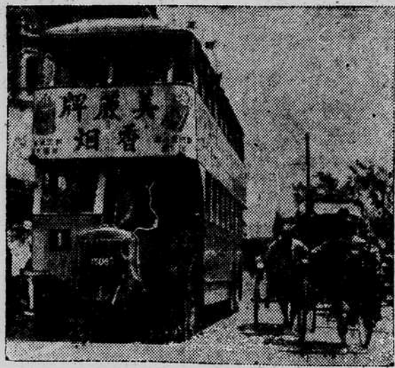
The old and new in transportation on the Bund in Shanghai—famous street along the waterfront. A modern bus and quaint coolie-drawn rickshaws compete for the passenger trade.

After the ancient empire of China became a republic in 1912, President Yuan Shih-kai tried to rule with a firm hand. Indeed, he believed in a limited monarchy; but even before his death in 1916, serious civil war had broken out. Different provincial rulers, tuchuns or war lords, raised armies of their own. They fought among themselves, frequently changing sides, and were not above playing the game of foreign interest, especially with the Japanese. Hundreds of thousands of men were constantly under arms. During the first World War, China finally took the side of the Allies. Afterward the Western powers began to show more good will. In 1922, nine of the powers, including Japan, agreed to see to it that China should continue as a nation and that no one should take any of her land.