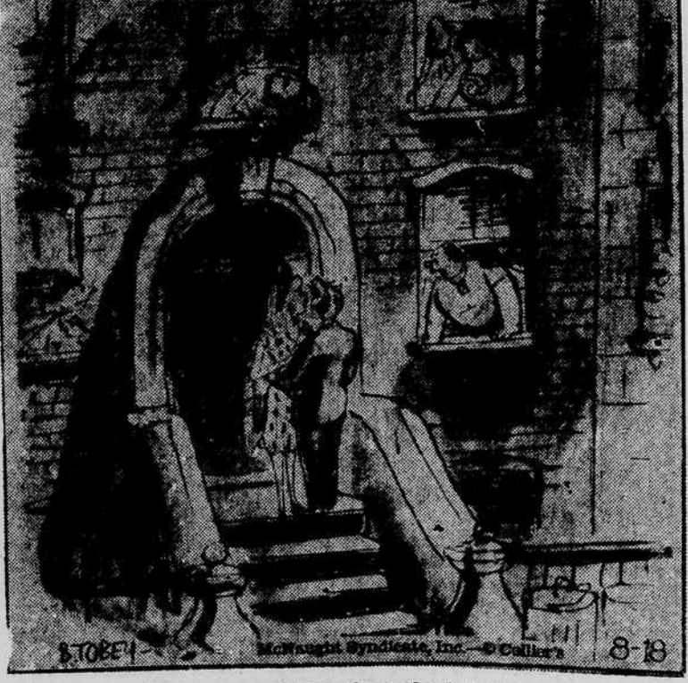
"If you weren't so stingy about that one