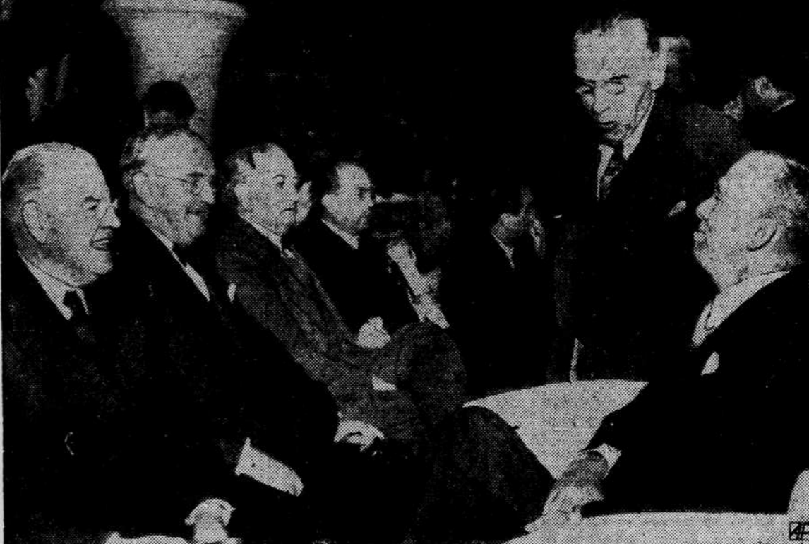
U. S. DELEGATES AT DEFENSE CONFERENCE—Rep. Sol Bloom (second from right), chats with Secretary of State George C. Marshall (right)...