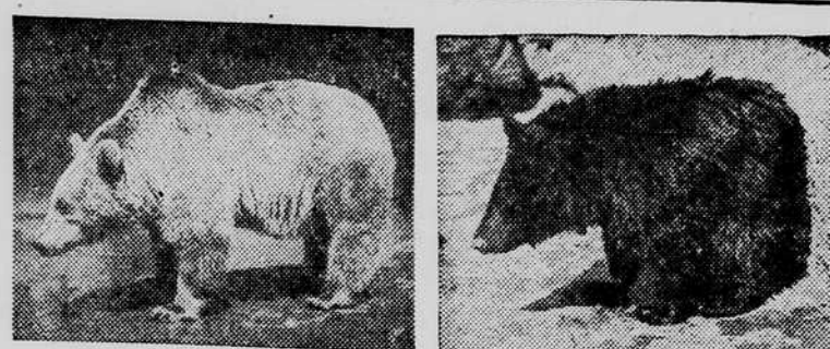
The Syrian bear a form of the brown bear found in Asia Minor and Syria, is small and light-colored. The Japanese bear, a very close relative of the Manchurian brown bear, is black or very dark brown.

Other forms of the brown bear are the Syrian bear, a small and light-colored animal found in Asia Minor and Syria; the Kashmir brown bear, also light-colored, found from the Tien Shan to the western Himalayas; the Siberian brown bear with dark legs; the Kamchatkan brown bear found in Kamchatka (Manchukuo) and the Manchurian brown bear, a black or very dark brown bear found in Mongolia and Manchuria. Oh Hokkaido Island, Japan, there is a brown bear which is a very close relative of the Manchurian bear. Some authorities believe it to be the same. Western China and Tibet have a bear of this group which is blackish in color, with a pale brown and whitish head. The hairs of the body are tipped with reddish buff or grayish white. This bear is known as the blue bear of Tibet. There was once a small bear of the brown bear group in the Atlas Mountains in North Africa. It was known as Crowther's bear. Two living specimens were captured near Tituan, Morocco, a century ago. They were small thickset and brown. The specimens were not saved and, as far as we know, there is no skin of Crowther's bear in any museum. At the present time, the animal is believed extinct. (Copyright, 1946, By The Grolier Society Inc., based upon The Book Of Knowledge) (Distributed By United Feature Syndicate, Inc.) TOMORROW: — Is the Earth Quite Round?