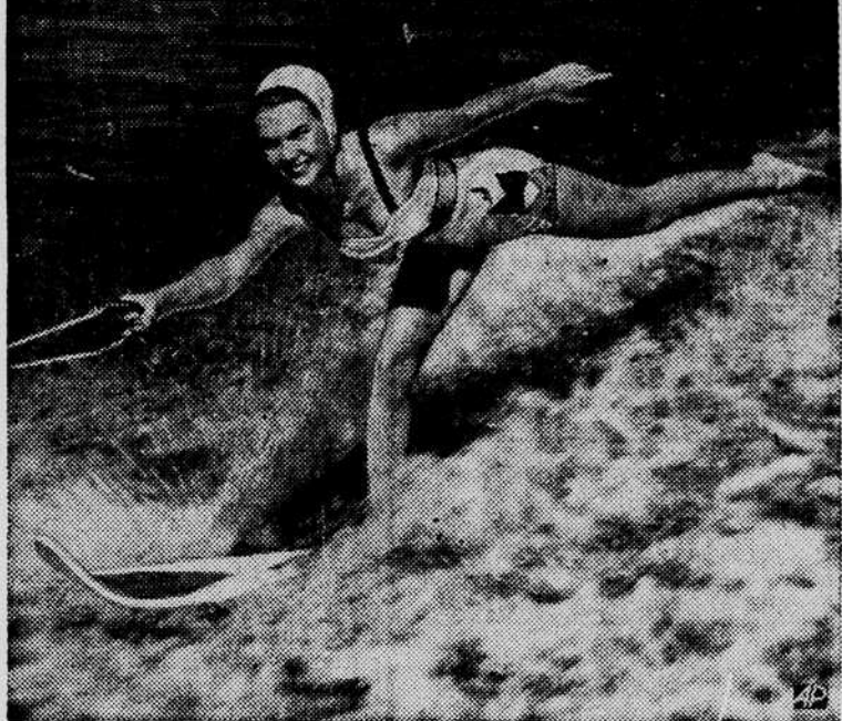
Fla., takes time out for a thrilling ski ride with water substituted the Army flanks time and again