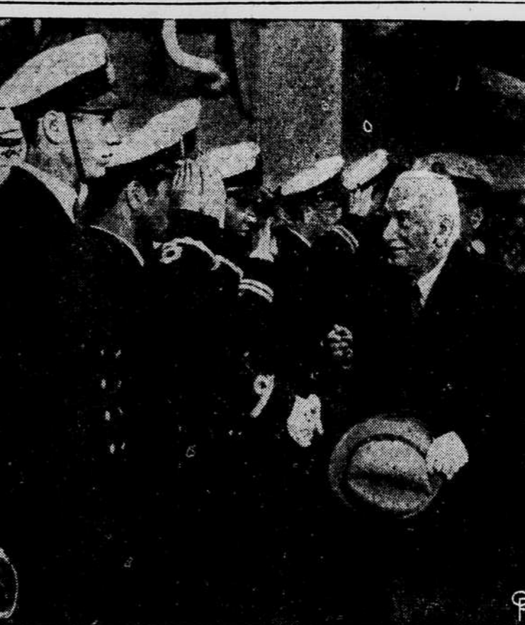
PRIME MINISTER OF GREECE, Themistocles Sophoulis, 85, is shown shaking hands with members of the crew of the destroyer Pindos after he had boarded the ship at Athens for a trip to Salonia. The aged Premier is now making a tour of northern Greece to inspect Greek Army units fighting in operational zones against the guerrillas.

LONDON, Nov. 28. — (AP) — British Foreign Secretary Ernest Bevin warned Russia tonight that the Western powers possibly would act on their own to save Germany and Europe from "chaos" if the Big Four failed to agree on Germany's future.