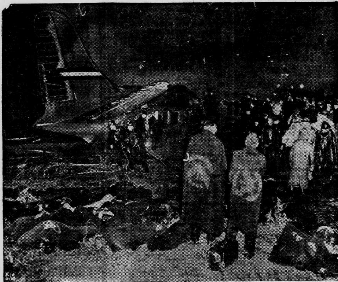
AIRLINER TRAGEDY — Among several tragic accidents to airliners during 1947 was this crash of a UAL plane taking off from LaGuardia Field, N. Y., May 29, in which 43 died.