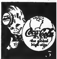
CAPITAL COCA-COLA BOTTLING CO. 315 W. Morgan St.