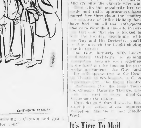
Office Boy we're all proud of your becoming a Captain and just promised, your old job is waiting for you!