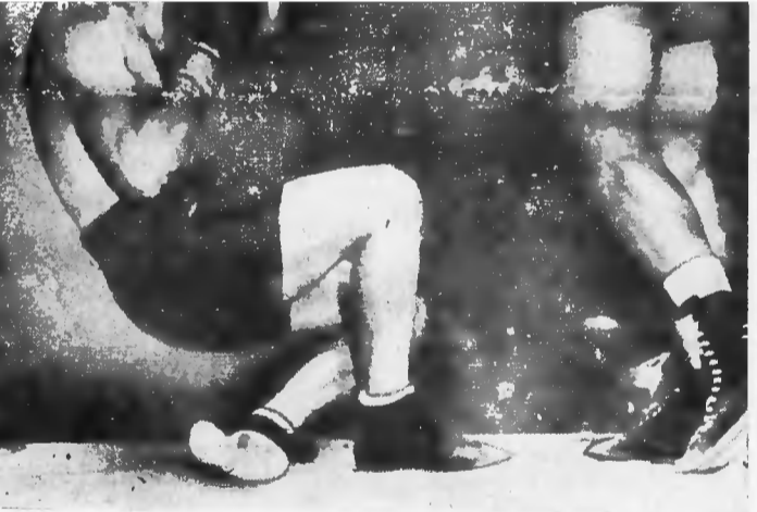
JOE GIVING CONN THE WORKS—Shown above is Joe Louis as he knocked Billy Conn out in the 8th round of their scheduled 15-round battle in New York last Wednesday night. Here's how it happened: In a flash Louis was in, and like a pile driver pounding a pole into the mud, his right ripped twice and, like a building falling apart after a shell hit, Conn started slowly falling down. A slashing, murderous left then left the challenger stretched flat on his back in the spacious Bronx park.