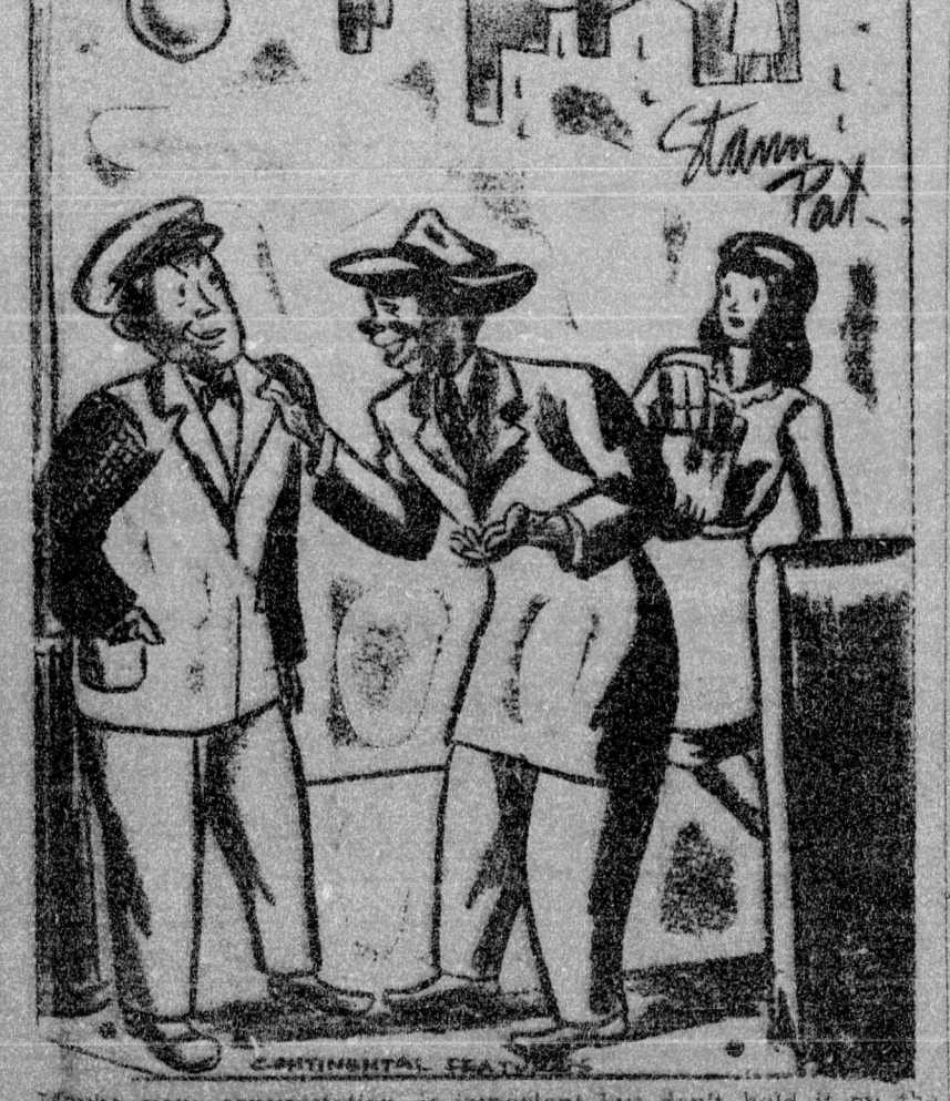
Maybe your conversation is important but don't hold it on the corner where you are blocking the passersby.