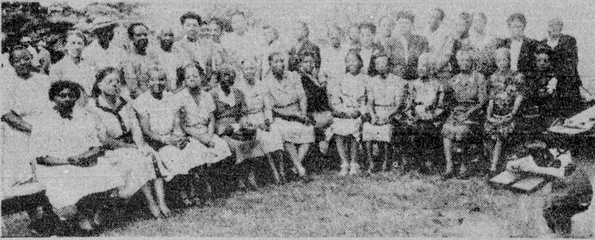
EASTERN STARS — The Raleigh Chapter of the Eastern Stars which met with Widow Son Lodge No. 4 in their final celebration of St. John's Day at Chavis Park Sunday are shown above. They were snapped previous to a repast of barbecue served by Widow Son Lodge. Reading left to right, first row: