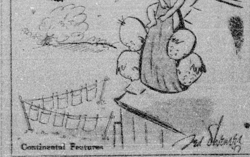
They not here don't you see all those distress signals down there.

Semi-finals will be held June 27th from 1 to 6 o'clock. Final affair of the occasion will be a dance given in W. D. Hill Recreation Center Hall Friday night, June 27th.