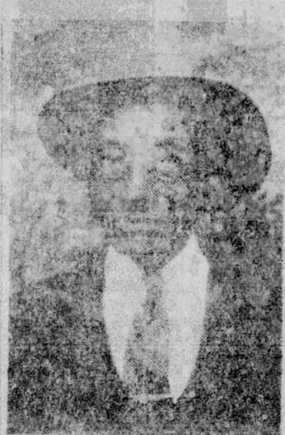
Portrait of a man in a suit, likely related to the 'PERSONALS' section.