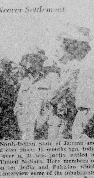
Kashmir Issue Nearer Settlement The future of the picturesque North-Indian State of Jammu and Kashmir has occupied the world ever since 15 months ago...