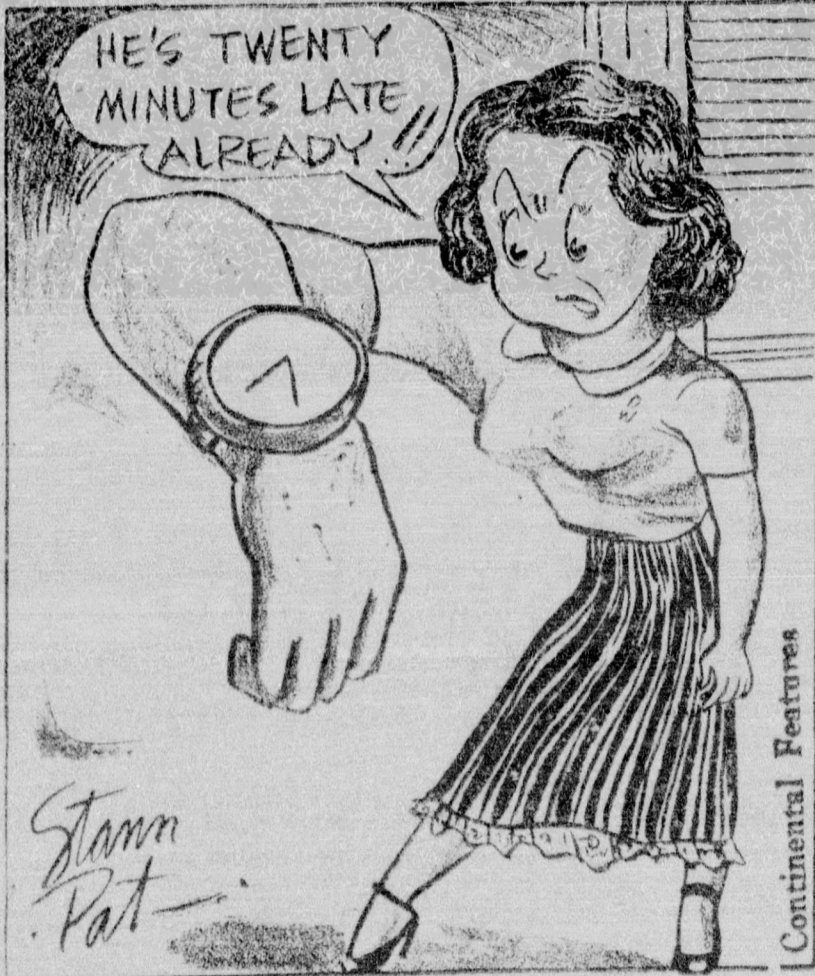
The Late date is likely to be the late friend.