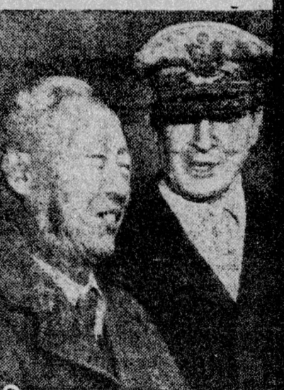
CRITICAL CONFERENCE — South Korean President Rhee and General MacArthur discuss the dangerous incidents occurring in President Rhee's nation.