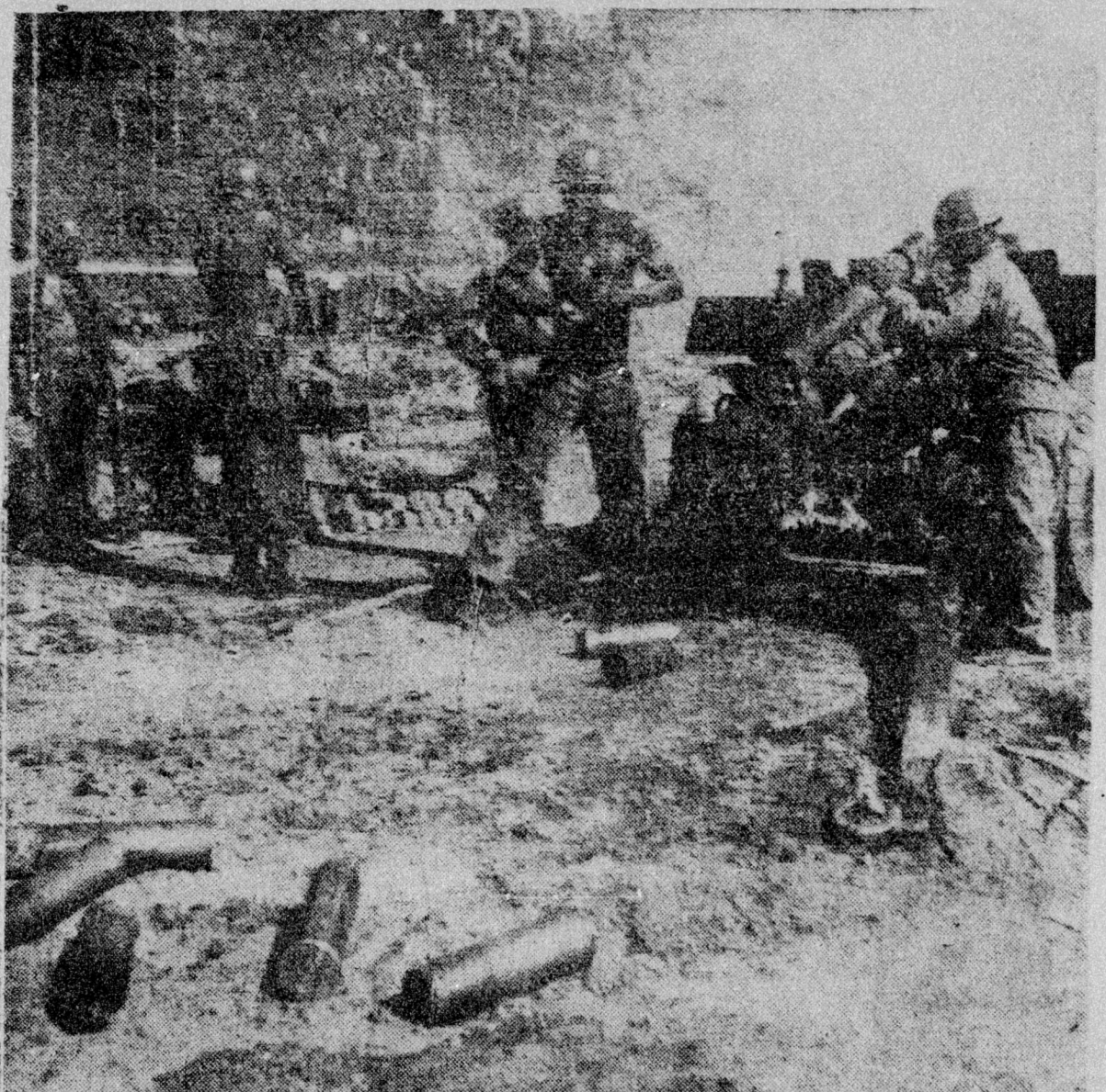
ACTION IN KOREA: Negro troops blast away at the enemy somewhere along the Korea front lines with their 105-mm howitzer. These soldiers have just fired a round of ammunition, evident from the soldier who is holding his ears in left foreground.

Chapel Hillians Seek Equal Staff And All Other Particulars CHAPEL HILL — A mass meeting here this week decided to institute an all-out suit against the town school board after Negro citizens obviously became fed up with a "run around" they were being given by the board on the matter of bringing Negro schools up to par with the white ones of the community.