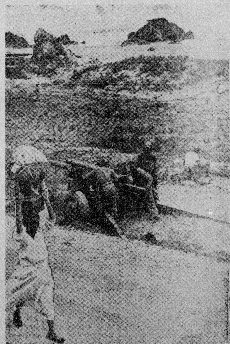
ENGAGEMENT KOREA: A 105-mm howitzer gun crew on a coastal town somewhere in Korea keep the ammunition going as a Korean woman flees her home with everything she can carry on her head. «