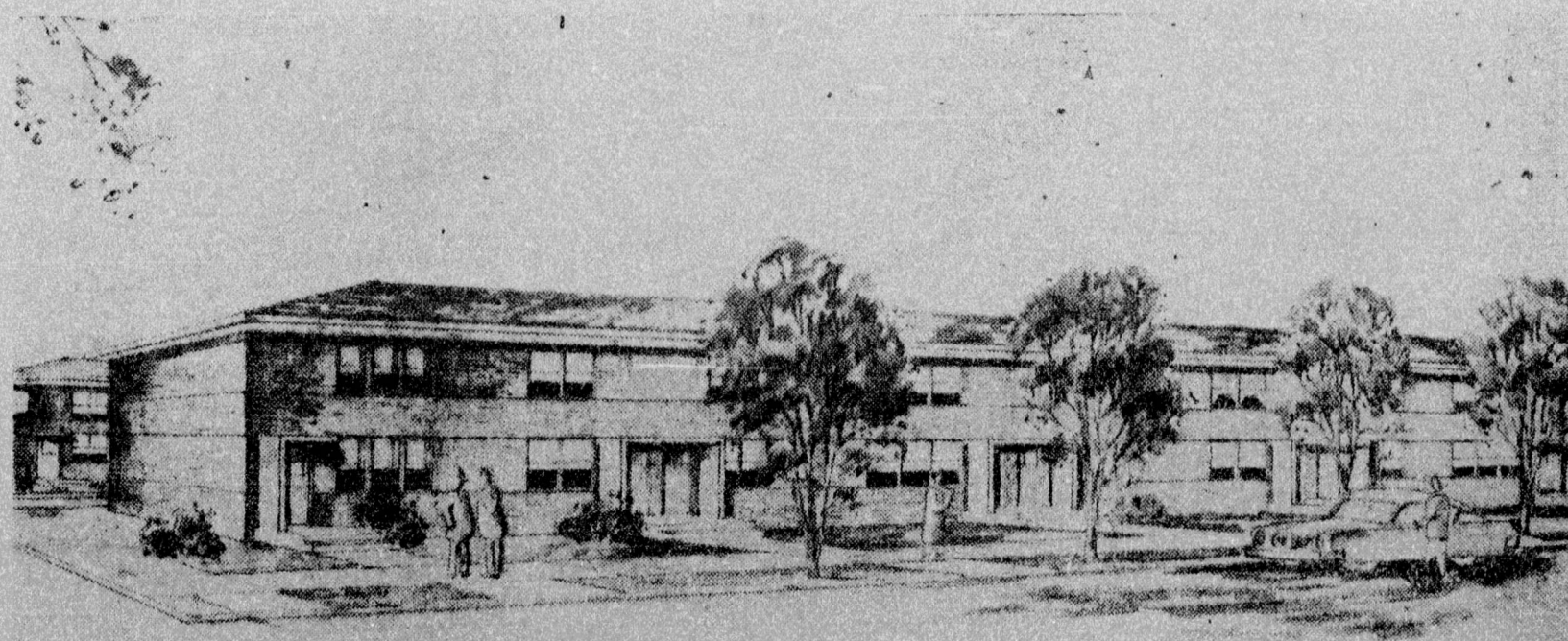
ROBERT S. JERVAY PLACE—Above is an artist's sketch of a unit of the new 250-unit Negro housing project to be erected on the southside of Wilmington.

Covering a four-block area, the development will be one of the most beautiful and modern to be found anywhere. It will cost approximately $2,000,000. Nearly