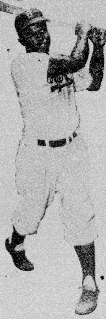
AMONG THE FIRST — Jackie Robinson, Brooklyn Dodger star, will be among the first Negroes to play in Raleigh's Devereaux Meadow with an all-Negro attraction when he brings his Major League all-star team into the Meadow on Thursday night, October 12.