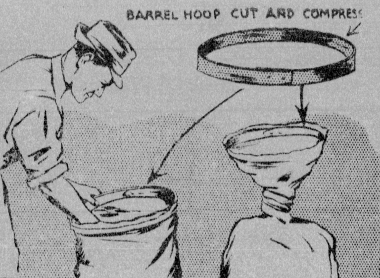
Avoid waste of feed by spilling with a small barrel hoop in mouth of sack. Keeps mouth open for easy removal and enables closing of sack with a couple of twists.