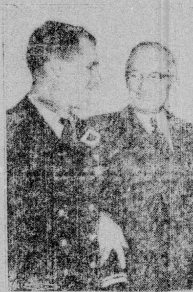
TRIED TO SAVE NEGRO FLYER —President Truman expresses his admiration of the efforts of Lieut. (jg) Thomas J. Hudner, USN, (left) who risked his life trying to rescue his shipmate, Ensign Jesse Leroy Brown, first Negro Naval aviator in history and first Negro Naval officer to be killed in any United States war.