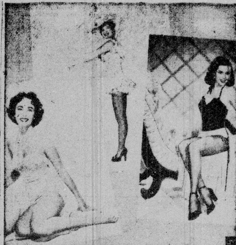
Elizabeth Taylor, Jane Powell and Ann Miller, famous stars of the MGM Studios, lead the parade of Hollywood actresses and actors in the Royal Parade of Stars promotion for Royal Desserts. Their pictures are featured on the back of each Royal package and in newspapers and magazines across the country. The campaign links the exceptional appetite and low-cost appeal of Royal Desserts with the most famous names in movies and in sports. Miss Taylor is currently being seen in "Father's Little Dividend," Miss Powell in "Royal Wedding," and Miss Miller in "Texas Carnival," all MGM productions.

Major General Lewis B. Hershey, director of the National Selective Service System.