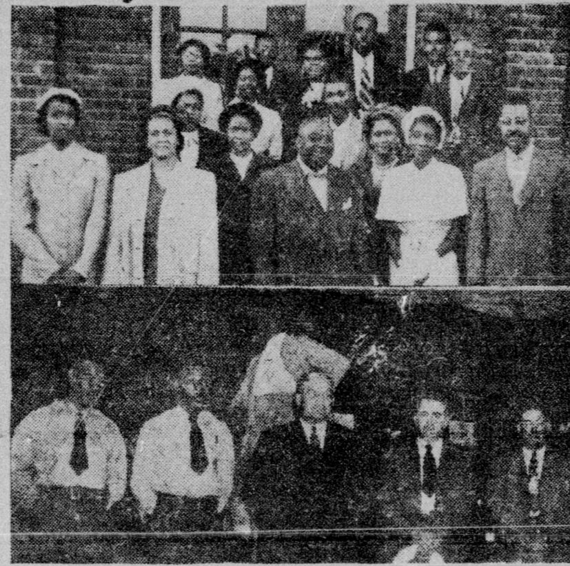
DEFENSE FUND GROUP FOR N. C. RAPE VICTIM — Shown above in top photo is the Citizens Committee of the Burlington Branch N.A.A.C.P. Pictured in bottom photo are members of the Burlington Police Department, Burlington Chief of Police and Alamance County Sheriff.