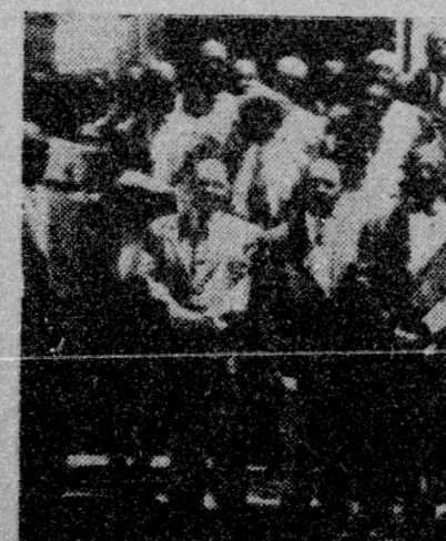
MODERATOR'S CLINIC — Shown above are members of the Moderator's Clinic who met at Shaw University last Wednesday and Thursday. The group is composed of Moderator's in Baptist Associations all over the State.

This would cost the State $75,000 to $100,000 a year. It would mean that 12 to 18 additional faculty (Continued on page 8)