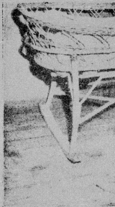
ESCAPES DEADLY BLAST—Little one-year-old Ella Mae Watkins sits on the floor beside his cradle from which she was thrown when an explosion destroyed a pumping station near the Watkins home.