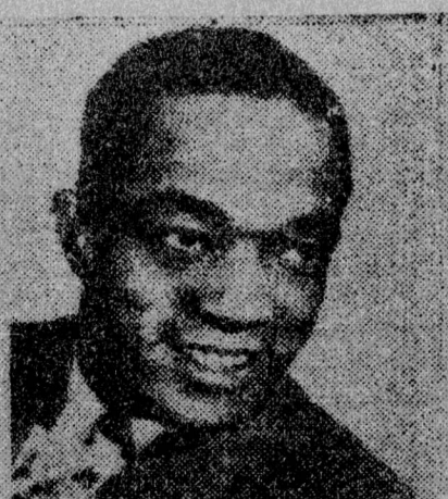
BUDDY JOHNSON Sender's dance to be staged at the Raleigh Memorial Auditorium on Monday night, August 20. The Johnson orchestra is