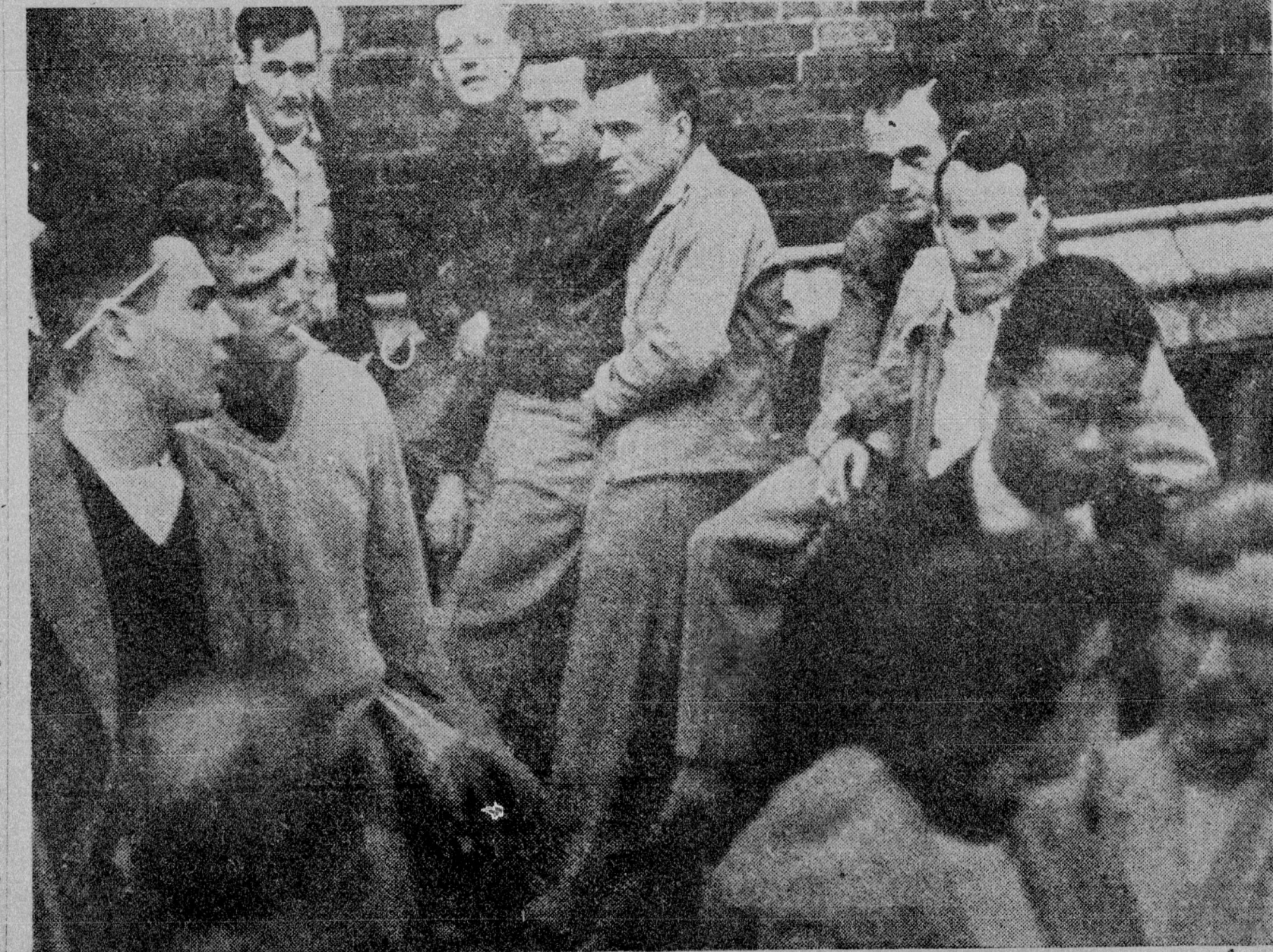
WHAT HAVE WE HERE? — The eyes of these white students at the University of Tennessee at Knoxville seem to be asking the question "What have we