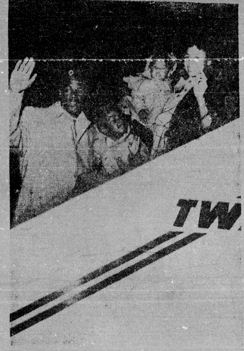
HIGH-FLYING FAMILY — Baseball star (and radio executive) Jackie Robinson, his wife and youngsters disembark from a TWA Constellation in Chicago, on the last leg of their trip from Los Angeles to New York. The grass cutting Brooklyn Dodger second baseman, who leaves for spring training in Florida soon, may have yet another month to feed before the season is over. This furthers the rumor that Robinson will retire from baseball in 1953 in order to devote more time to his family.