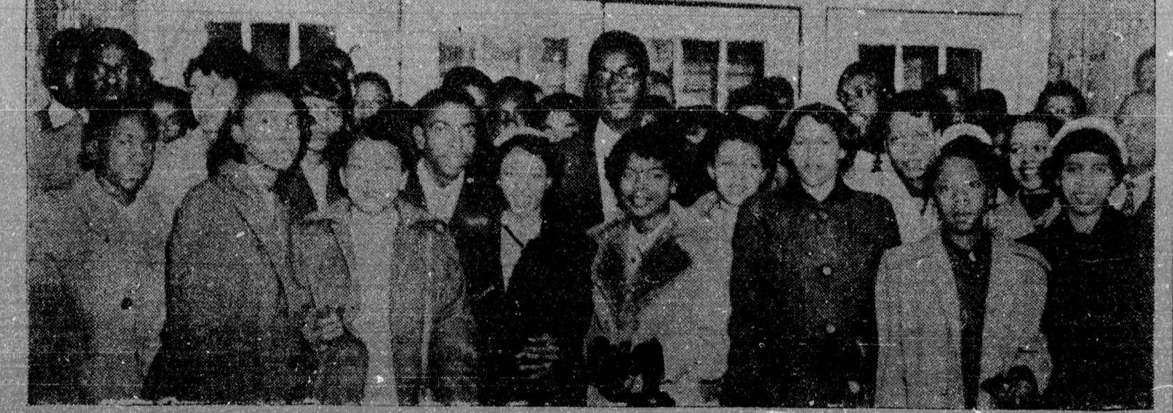
SEE HOW IT'S DONE — One point of main interest for students from 13 North Carolina towns and cities on tour of Durham, Greensboro, and Raleigh last week was the Carolinian's home plant where they saw many points of operation. Students from high schools in High Point, Florence, Clarkton, Brown Summit, Summerfield, Sedalia, Greensboro, Reidsville, Madison, Pleasant Grove, Yanceyville, Burlington, Trinity Asheboro and Goshen were among those making the annual tour of North Carolina Negro Businesses under the sponsorship of the Phi Beta Sigma Fraternity.