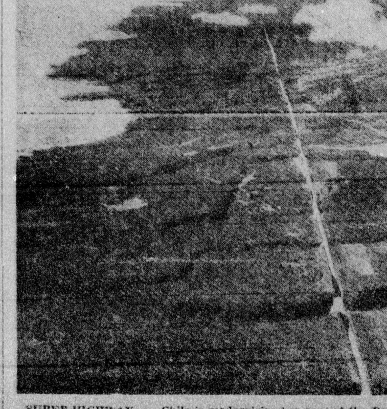
SUPER-HIGHWAY — Chile is modernizing her part of the Pan-American highway, which includes 2,112 miles of the long road. The road in Chile follows the Pacific coast.