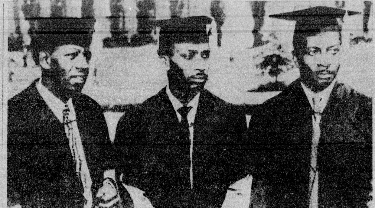
BRAND NEW MASTERS IN PUBLIC HEALTH EDUCATION -- Public health educators from Connecticut, Alabama, and Georgia were among recipients of masters of science degrees in public health education at North Carolina College's 41st commencement, exercises recently.