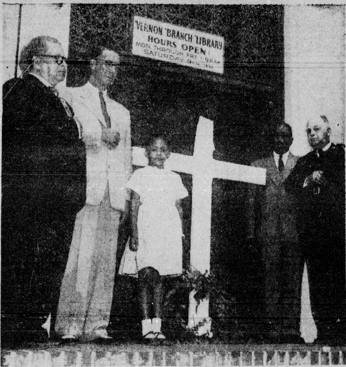
Senator Estes Kefauver, leading contender for the Democratic Presidential nomination, pays tribute to the war dead of Los Angeles Negro Community, at special Memorial Day ceremonies. Senator Kefauver promised to "do more to break down the artificial barriers that separate us than anything that has yet been done." Senator Kefauver declared: "It is my pledge to you that since one of the major interests of my life is to break down those barriers, I will work as hard as I can to extend democracy in all of our social and economic programs."