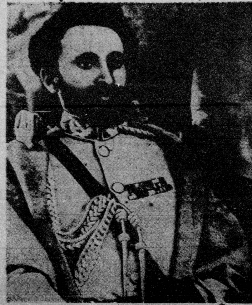
CELEBRATE HIS REIGN—Conquering Lion of the Tribe of Judah, Haile Selassie I, Elect of God, Emperor of Ethiopia, is pictured during the recent celebration in honor of his stellar reign. Emperor Selassie was hailed by leaders all over the world for the role he has played in getting Ethiopia back on her feet following Italy's invasion.