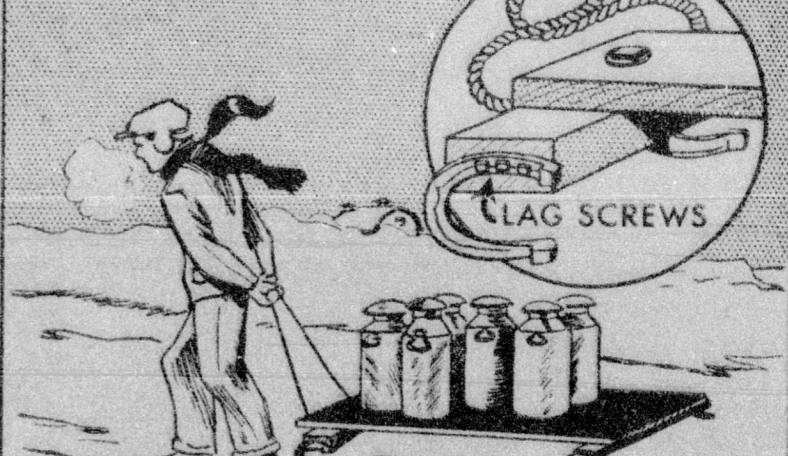
HORSESHOES AS SLED RUNNERS ... Discarded horseshoes, attached to a sled by means of small lag screws, make good runners for a sled that is used about farm buildings for simple chores. Holes in shoes are enlarged to receive the screws.

METHOD: Stir together egg, brown sugar, and vanilla. Add sifted flour mixed with salt and soda. Add walnuts—keep the pieces fairly big, their crispness contrasts temptingly with the chewy texture of the cookie. Spread in buttered 8-inch square pan. Bake in moderate oven (350° F.) 18 to 20 minutes (cookies should be soft when taken from oven). Leave in pan; cut in squares when needed.