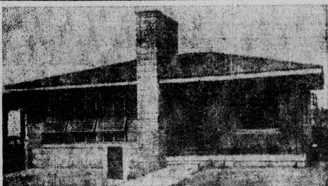
OUR NEW OFFICE BUILDING

GENUINE CHEVROLET PARTS COME TO SEE US WHEN IN FUQUAY SPRINGS—VARINA OR ANGIER