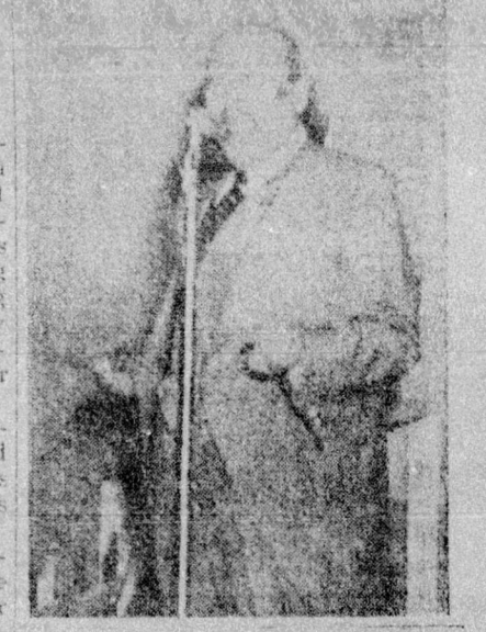
"DADDY" GRACE Charlotte Site Of Huge 'Saving' Effort

CHARLOTTE — The citizens of Charlotte were upset about the ever-increasing homicide rate here until last Sunday morning when Bishop C. M. "Daddy" Grace came to town and "saved" 500 people in a record four hours. Booming widely as the "faithful" crowded into the House of Prayer for All People on S. Long St. to watch him in his "saving" efforts, Bishop Grace utilized the services of several assistants, ministers and laymen of the church group founded by himself as he baptized a half thousand souls.