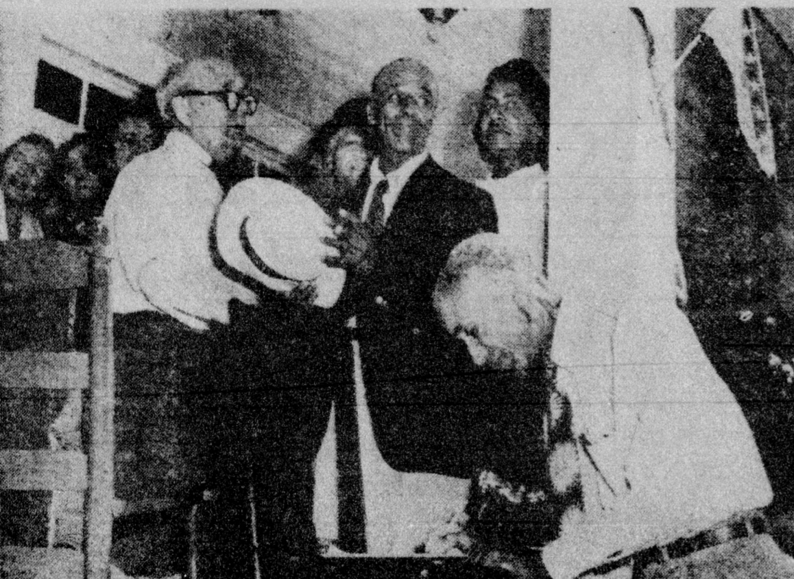
ALL IN THE FAMILY — It was all in the family when the Hausers, both white and colored, gathered in their first annual family reunion at Yadkinville last weekend. Show are members of the white family descend-