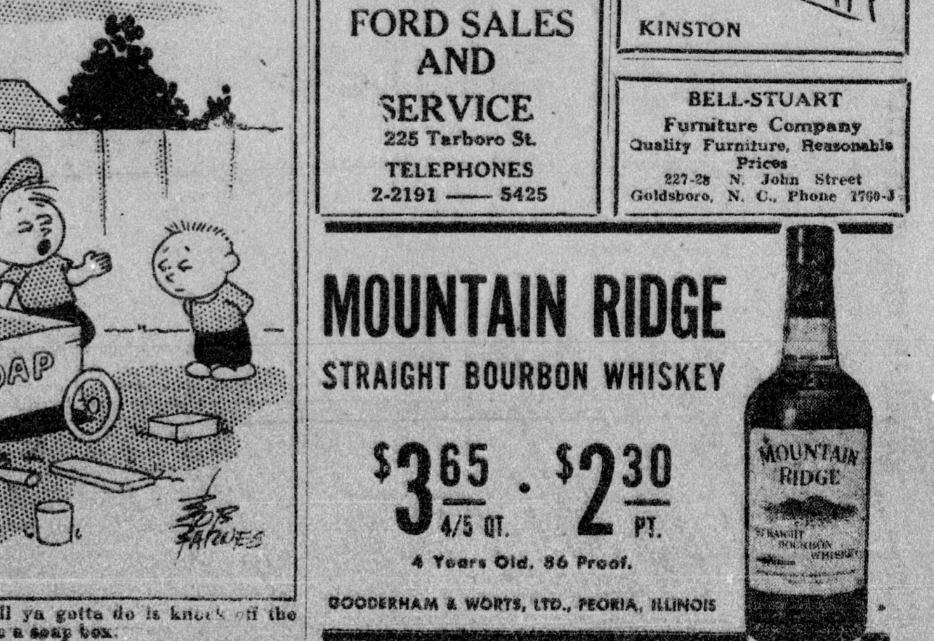
It's a convertible... all ya gotta do is knock off the wheels an' convert it back to a soap box.