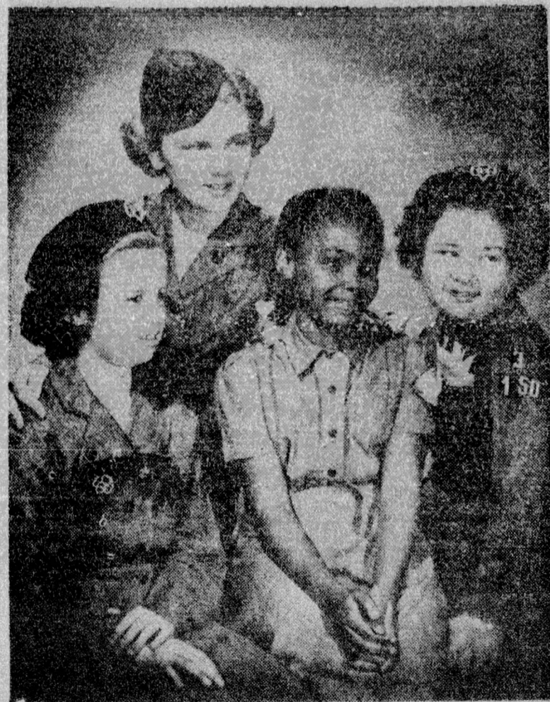
"SITTING" CHAMPS: Marking unique Girl Scout service, these girls gave voluntary baby-sitting service to mothers on last week's election day. Nation-wide cooperation by these and other groups was major factor in highest popular vote in presidential history. Girl Scouts plan extension of program in future elections.